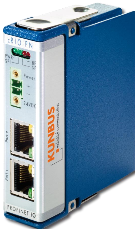
Figure 1: cRIO PN module

Important note: The cRIO PN module is supported only in CompactRIO reconfigurable chassis, such as an NI cRIO-911x, and NI Single-Board RIO devices.